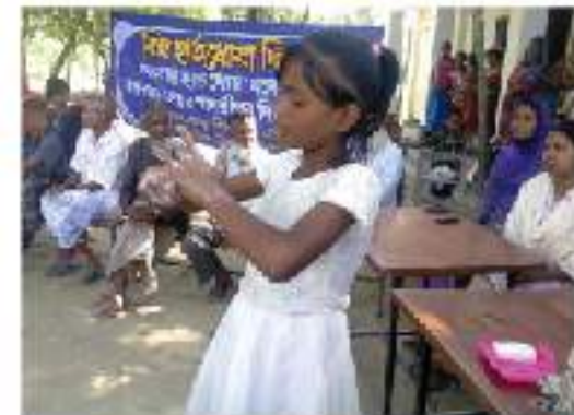
Hand Washing Orientation

Non Communicable Disease (NCD) project has completed its 2nd year through joint collaboration with WHO and Bureau of Health Education, Bangladesh. The aim of the project was to sensitize and raise awareness of community and school students on non-communicable diseases and changing life style to avoid the risk factors to prevent and protect from diseases.