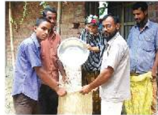
Fund raising for health clinic

Reliable Health Services project (RHS): CHDP strengthen integrated primary health care system by implementing Reliable Health Services (RHS) project at Badarganj Upazilla assisted by Global Care through financial support from Korean International Cooperation Agency (KOICA). This project is initiated from beginning of 2013 for 5 unions of Badarganj with a view to increase access in sustainable health services overseen by community groups and respective government-led institutions together. The main focus of this project is identifying and balancing the roles of the three key parties – the community, service providers, and local governing bodies. RHS project ensured collaborative partnerships, through facilitating coordination meetings where government and NGO staff seek to reduce gaps and reduce overlap of services with data-based decisions about use of existing resources. Last year, this project inaugurated two safe delivery units in two Unions with the help of government authority and 311 deliveries were performed successfully in 24 hour 7 day a week service delivery points.