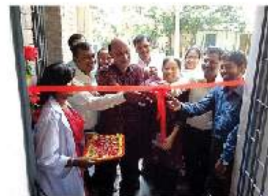
New SDU opening by DD-FP at FWC

Reliable Health Services project (RHS): CHDP strengthen integrated primary health care system by implementing Reliable Health Services (RHS) project at Badarganj Upazilla assisted by Global Care through financial support from Korean International Cooperation Agency (KOICA). This project is initiated from beginning of 2013 for 5 unions of Badarganj with a view to increase access in sustainable health services overseen by community groups and respective government-led institutions together. The main focus of this project is identifying and balancing the roles of the three key parties – the community, service providers, and local governing bodies. RHS project ensured collaborative partnerships, through facilitating coordination meetings where government and NGO staff seek to reduce gaps and reduce overlap of services with data-based decisions about use of existing resources. Last year, this project inaugurated two safe delivery units in two Unions with the help of government authority and 311 deliveries were performed successfully in 24 hour 7 day a week service delivery points.