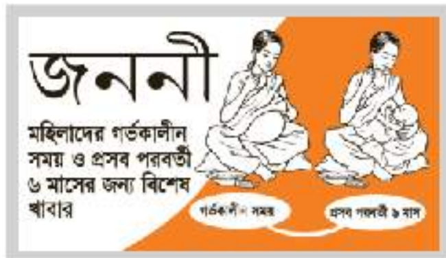
Mother Supplement (LNS)

Rangpur-Dinajpur Nutrition Study (RDNS) project assesses nutritional deficiency and provides supplements to pregnant mothers and their children through CHWs in partnership with ICDDR,B and University of California, Davis. This Project successfully completed 4th year with ensuring a sound primary health care system.