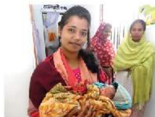
New baby born at FWC-SDU