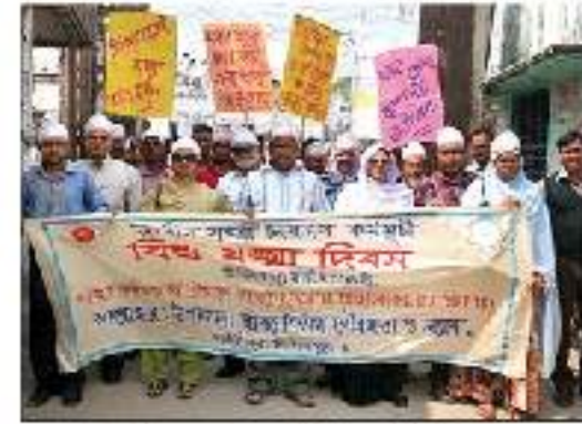
Celebration of World TB Day

Tuberculosis Control Program (TB): LAMB has been working as a part of national TB control program for over 25 years in 4 upazilas of 2 districts. In 2014, a total of 907 patients were screened by labs sputum tests and identified as new or relapsed TB. The case notification rate (CNR) was 115 per 100,000 and cure rate was 97% (national is 93%)