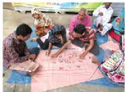
Community people drawing risk map

Disaster Risk Reduction (DRR) Project & Emergency Relief: DRR project is working for building disaster resilient communities through local churches as well as Ward Disaster Management Committees (WDMC), utilization of local resources, alternative livelihood activities, disaster preparedness, information centers, Participatory Action & Development groups, mitigation activities and emergency response. Now this project operates in two new sub-districts namely Nawabganj and Kaunia under Dinajpur and Rangpur Districts respectively. As a part of emergency response, LAMB DRR project extended hands to the flood affected poor people of Kaunia and Hathibandha Upazila under Rangpur and Lalmonirhat Districts respectively by the assistance of